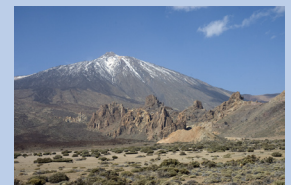
Mount Teide, S.H.I.F.T. Tenerife, 2008

A meditation at this location, which is planned for 2008, shall bring the four elements into complete equilibrium, restoring all the nutritive life forces of the planet. People who meditate here shall leave with great strength at a physical level, for in them shall be reinforced all the elements of their physical being.