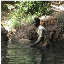
Healing Springs, S.H.I.F.T. Rift Valley 2007