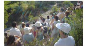
Horseshoe of Life, S.H.I.F.T. Montserrat 2005

This focal point is where all the energies of birth or creation in the planet are focused. It is like the umbilical cord of the planet. At this stage our civilization is leaning towards self destruction and therefore the meditation conducted at this focal point allows us to achieve harmony with the forces of creation – water being one of the key elements.